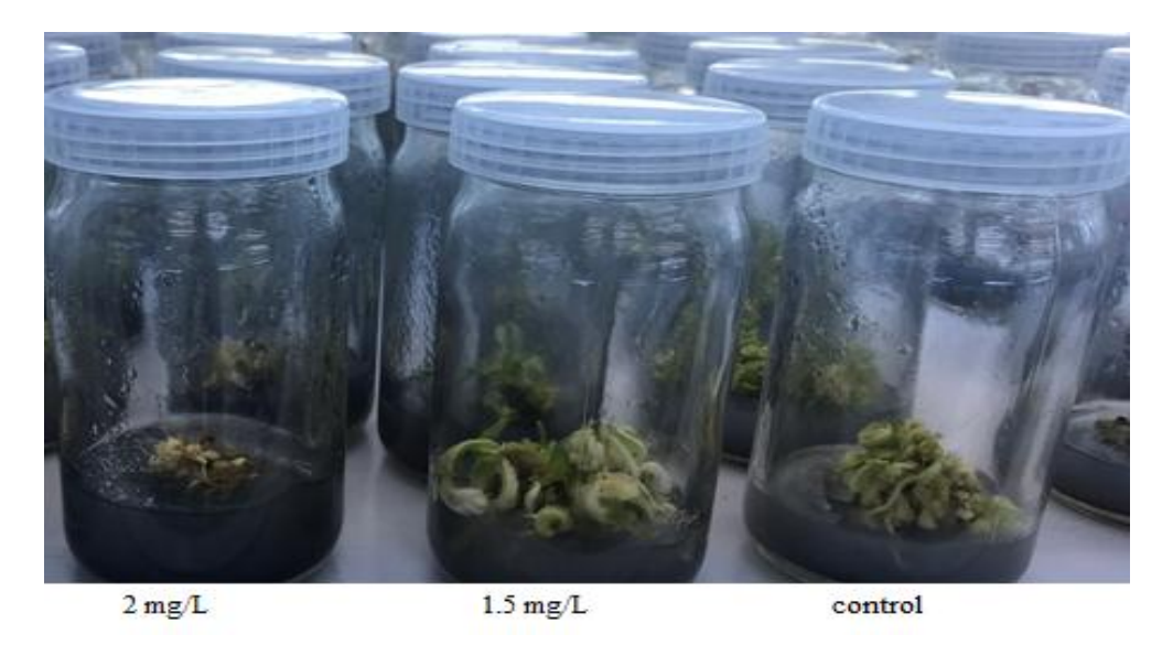
Fig.2. Effects of different concentrations of chalcone derivatives on somatic embryogenesis of in vitro culture experiments