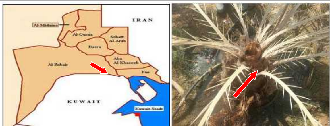
Fig. (1): Safwan border area (arrow) Fig. (2). symptoms are yellowish, wilting & rigorism