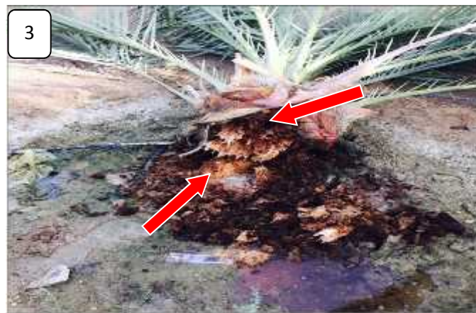
Fig. (3): Symptoms are attacked the crown area or roots.