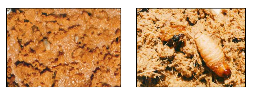
Figure 6. Development of R. ferrugineus larvae on an artificial diet.