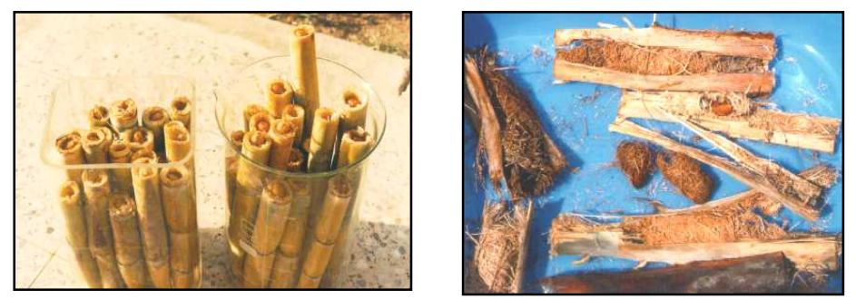
Figure 5. Development of R. ferrugineus larvae on sugarcane stems.