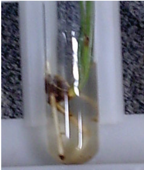
Fig. 3. Contaminated date palm plant before replanting on bee venom medium (rooting stage)

Fig. 2. Contaminated date palm plants after replanting on bee venom medium (multiplication stage).