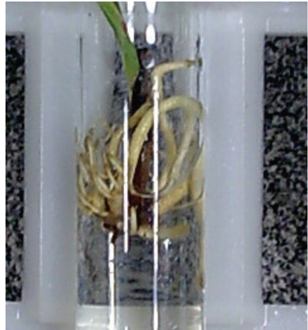
Fig. 4. Contaminated date palm plant after replanting on bee venom medium (rooting stage).