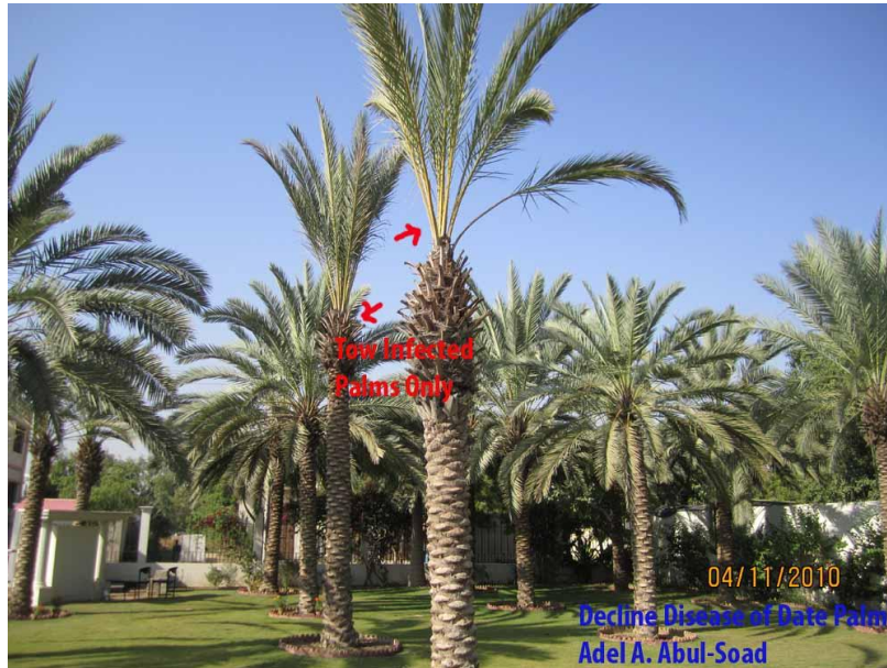
Figure 5: The Decline Disease Selectivity to Date Palm Trees in the Backyard Garden of HEJ, Karachi University in 2010.

Other findings of the Crop Disease Research Institute (CDRI), Pakistan Agriculture Research Council, Karachi University Campus indicated that the examined plant samples showed Pathogenic Fungi associated with the bark disease. Furthermore, visual examination revealed that all samples were severely infested with insect pests. Root-knot nematode and other Tylenchida 4 were observed. The recommended application was Topsin-M or Carbendazim which used as bud drenching and soil drenching. Three to Four grams of Carbofuran have been used. Unfortunately, such treatment had no effect. Eventually, the treated trees died and symptoms started to appear on the adjacent trees associated with the common symptoms of the disease.