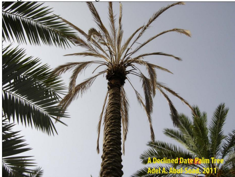
Figure 4: The Late Stage of Infection of a Date Palm Tree.