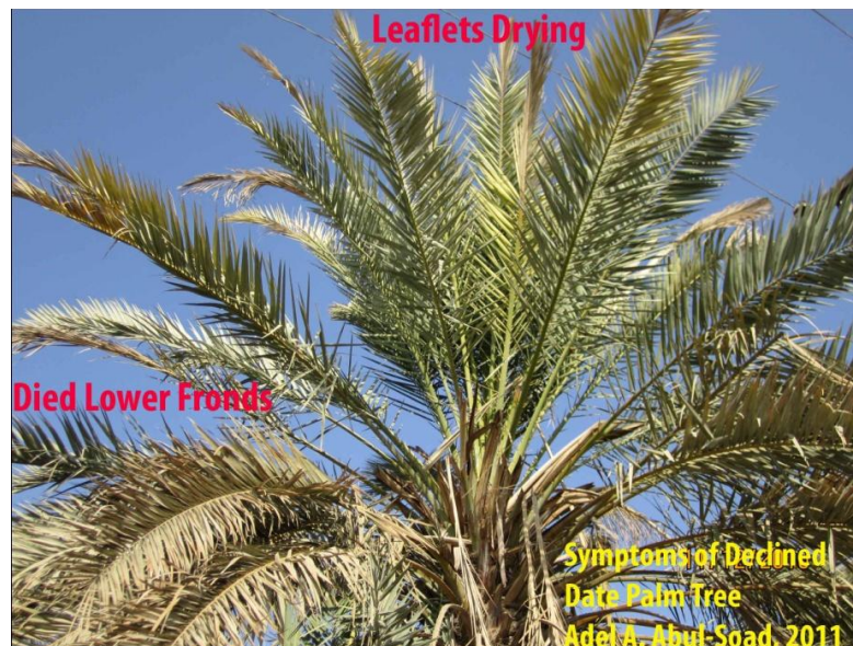
Figure 2: Frond Symptoms of Date Palm Decline Disease.

The symptoms are starting with orange yellowish coloring for the fronds' midrib (rachis) then the leaflets (pinnae). Such symptom starts from outer-lower frond whorls toward central younger fronds (Fig. 2). Within a single frond drying begins from the terminal part to cover the whole frond. Eventually, the entire frond turns to pale brown color and the tree dies within few months.