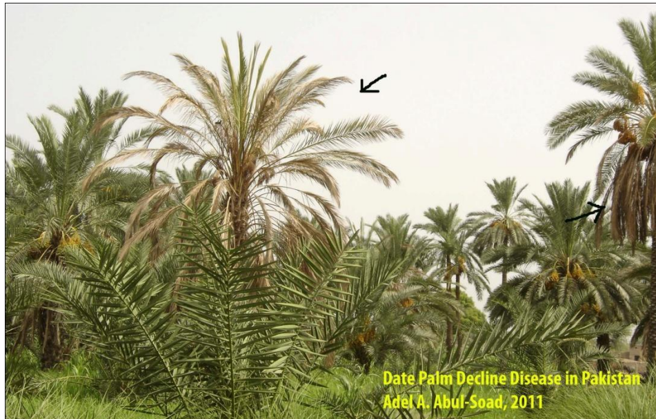
Figure 1: Normal and Infected (Referred by Arrows) Date Palm Trees with Sudden Decline in Pakistan.