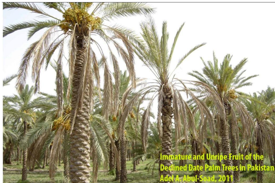
Figure 3: Infection during Fruit Development in Summer Caused Immature and Unripe Fruit.

Infected trees are dramatically broken-down (complete drying) within 3-6 months. But, sometimes, it takes 1-2 years during which trees stopped fruiting (Fig. 4).