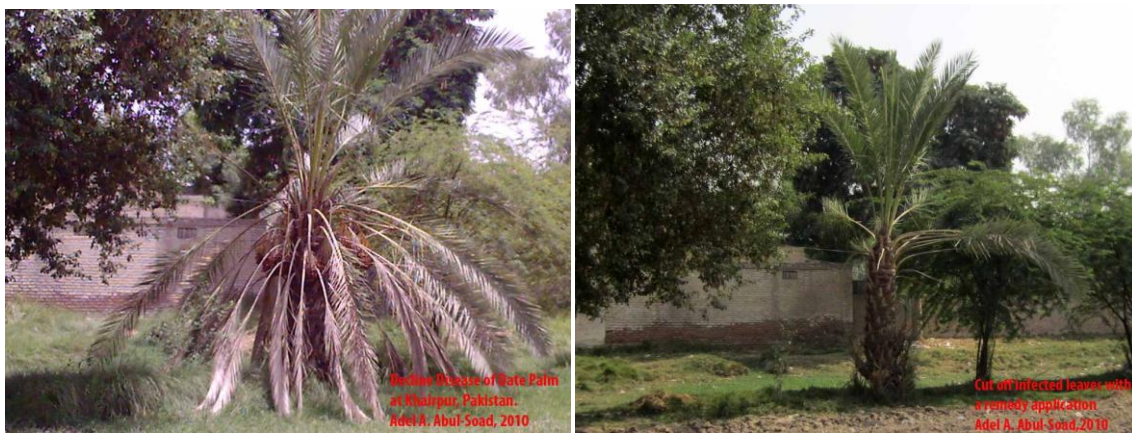
Figure 7: Infection during Fruiting (Left Photo) and Remedy Treatment Application (Right Photo).

fruit bunches dried out at Khalal stage and failed to reach Rutab stage. Once the tree was affected by the pathogen, the lower 2-4 frond whorls started drying and dangled down within 2 months. A tree with dangling dried fronds and yellowish color of the central young fronds is a general symptom of the latent infection. The above mentioned four-tired remedy procedure stopped the drying out of remained green fronds at the center (Fig. 7). Maintaining a good position needs soil elevation and enhance of soil drainage. The precipitate (silt) of Sindh river bed could play a role for enhancing the soil properties and reduce the infection of such disease by finding a fresh and nutritive bed for the roots.