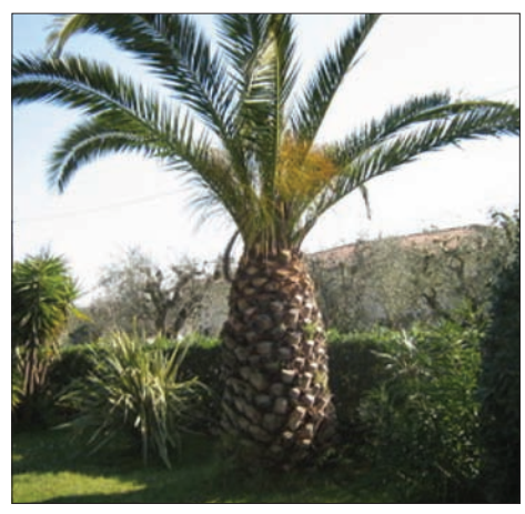
Before the treatment