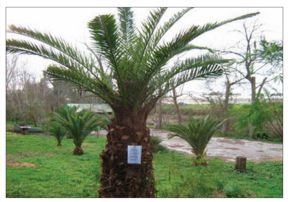
Palm tree 60 days after the treatment Test on a palm tree attacked with the foot and counting of the results of treatment ECOPALM