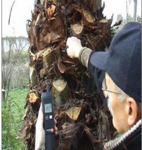
Duration of the treatment: 1 hour/palm tree 10. Some examples of treatment Palm tree tackled - a hole - Control of temperature and noise.

ECOPALM BOX is already equipped with a diesel electric generator and a control panel. It can function independently on traffic moving or stationed on the place of the desinfestation. ECOPALM BOX is conceived for the disinfection of the palm trees directly on the site of demolition. It makes it possible to completely disinfect the sheets and the trunk placed inside