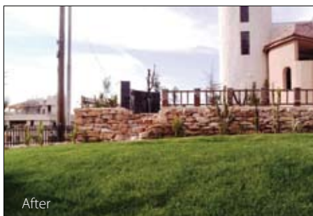
Fig. 3. Jordan lawn grass test in 2005 (1)